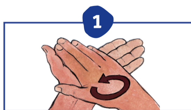
Rub palms together.