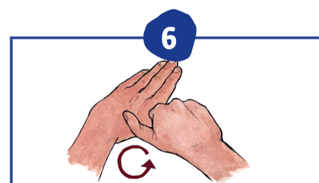
Rub each thumb with opposite palm. Swap hands.