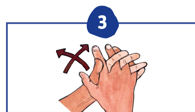
Rub fingers between each other.